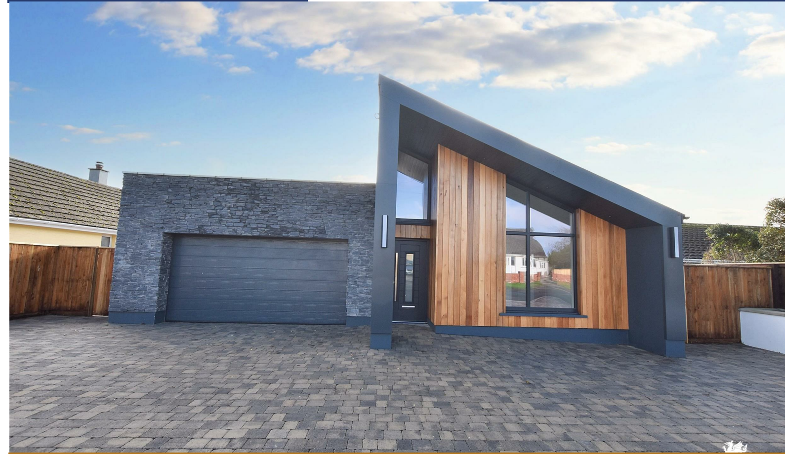
"34 Church Road", Roch, Haverfordwest, Pembrokeshire, SA62 6BG

WE WOULD LIKE TO POINT OUT THAT OUR PHOTOGRAPHS ARE TAKEN WITH A DIGITAL CAMERA WITH A WIDE ANGLE LENS. These particulars have been prepared in all good faith to give a fair overall view of the property. If there is any point which is of specific importance to you, please check with us first, particularly if travelling some distance to view the property. We would like to point out that the following items are excluded from the sale of the property: Fitted carpets, curtains and blinds, curtain rods and poles, light fittings, sheds, greenhouses - unless specifically specified in the sales particulars. Nothing in these particulars shall be deemed to be a statement that the property is in good structural condition or otherwise. Services, appliances and equipment referred to in the sales details have not been tested, and no warranty can therefore be given. Purchasers should satisfy themselves on such matters prior to purchase. Any areas, measurements or distances are given as a guide only and are not precise. Room sizes should not be relied upon for carpets and furnishings.